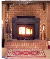
Firewood is already cut, split and stacked for your use!

FREE WIRELESS INTERNET! Bring your laptop, but promise you won't do anything work related. Instead, use it to get more info on local places to visit! You will find most everything you need already waiting for you. The cabin is modern and fully equipped. Think of it more as your private place and not a rental property. There is a TV/VCR/DVD, and large selection of great movies to watch. Bring your CDs or DVDs, you can play them while visiting. There is electric heat for chilly nights, but then again you will probably be cozy in front of the woodstove insert.