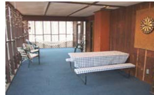
Enjoy the weather on the screened porch, have lunch, or play darts.

Take the best nap you have ever had lounging in the hammock on the screened porch! The porch also has comfortable chairs and a picnic table for your use. In the evening, the porch is still a great place to hang out at. Dimmable icicle lights surround the outside walls