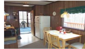
Have your morning coffee while watching the birds at the feeder.

At the Bonne Brae Cabin, we provide all linens & towels, basic items, napkins, paper towels, pots, pans, dishes, etc.. (You bring the food, drinks, & charcoal). You will find board games, cards, puzzles and plenty of brochures on things to do in and around the area. A grocery store is nearby if you need anything. Yes